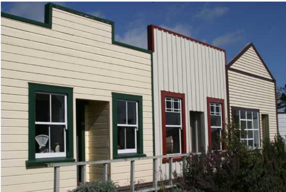
Taranaki Pioneer Village