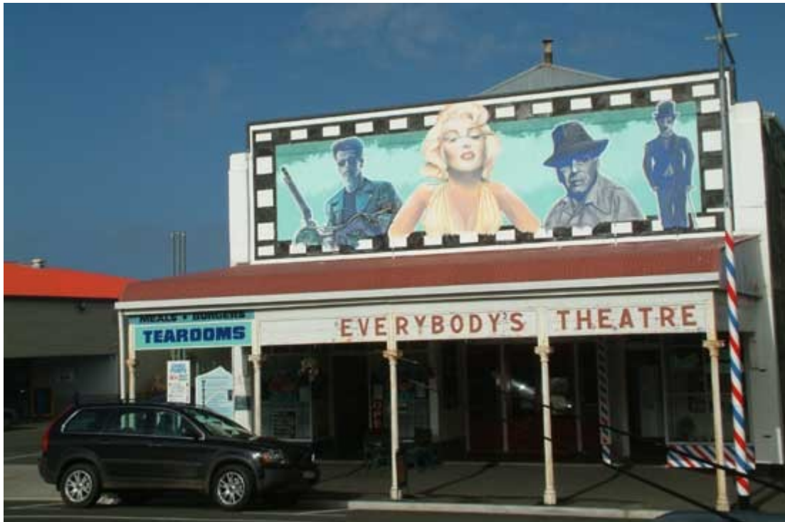
Everybodys Theatre, Opunake

parading his magnificent torso for all to see. I watch as a cloud briefly shadows his icy crown, and as he shakes it free, I understand something about heart and soul of the region: it's as solid as a rock, whatever the past has thrown at it, and no matter what the future will bring.